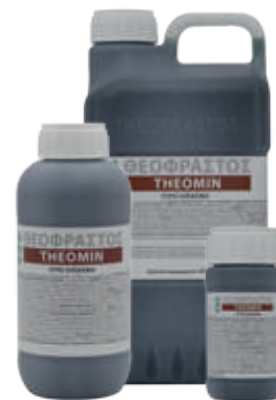
Supplied in 0.2L, 0.5L, 1L and 5L .

It should not be combined with calcium-based compounds. Foliar application at 100-200cc/100L water/0.1ha. Application via irrigation systems at 1-1.5 L /0.1ha.