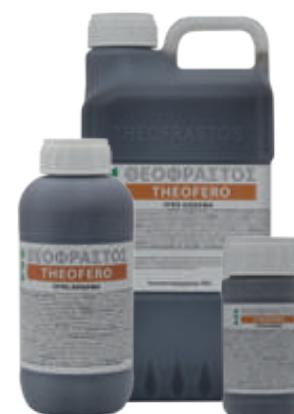
Supplied in 0.2L, 0.5L, 1L and 5L.

• Foliar application at 300-500cc/100L water/0.1ha. Application via irrigation systems at 0.5-1 L /0.1ha.