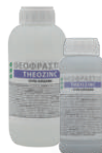
Supplied in 0.5L and 1L.

• Foliar application at 100-150cc/100L water/0.1ha. Application via irrigation systems at 0.5-1 L /0.1ha.