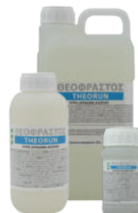
Supplied in 0.2L, 0.5L, 1L, 3L and 5L .

• Foliar application 300-500cc/100L water/0.1ha. Application via irrigation systems at 1-2 L /0.1ha