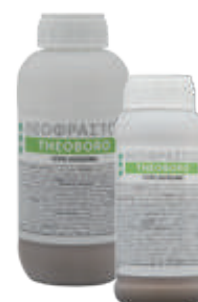
Supplied in 0.25L and 0,5L .

• Foliar application: Lettuce/Salads at 20-30cc /100L water/0.1ha, Apple, Pear, Mandarin, Cucurbits at 50cc /100L water/0.1ha, Olive, Grapes, Tomato, Pepper, Eggplant at 100cc /100L water/0.1ha. Application via irrigation systems at 150-500ml /0.1ha.