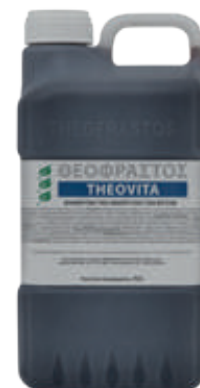
Supplied in 5L.

The Liquid fertilizer THEOVITA supplies the soil and plants with nitrogen, Vitamins of B-Complex and organic matter through irrigation instantaneously, via a slow release procedure. Due to the B-Complex content of THEOVITA is used to recover plants under stress, especially during transplanting; moreover, THEOVITA provides a very good and healthy root system for plants. The organic complex of THEOVITA increases the absorption of nutrient elements and the ability of ion-exchange, which are necessary for the plants. It is also observed that THEOVITA provides an early 7-10 days maturation of fruits and plants produce more ethylene, when is applied through irrigation systems at 1-2 L /0.1ha. In general, small plants are developing vigorously and mature plants produce more sugars, resulting in a better appearance and colour of fruits (small fruits enlarge their size first, increase sugar content second and finally they get better colour and appearance).