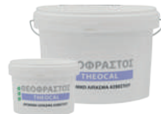
Supplied in 500gr and 5 kg .

• Foliar application: Lettuce/Salads at 20-30gr/100L water/0.1ha, Apple, Pear, Mandarin, Cucurbits at 50gr/100L water/0.1ha, Olive, Grapes, Tomato, Pepper, Eggplant at 100gr/100L water/0.1ha. Application via irrigation systems at 0.5-1 kg /0.1ha.