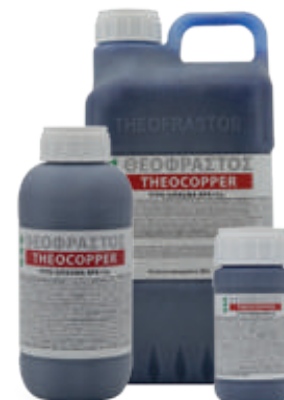
Supplied in 0.2L, 0.5L, 1L, 3L and 5L .

• Foliar application at 300-500cc/100L water/0.1ha. Application via irrigation systems at 1-2 L /0.1ha.