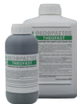
Supplied in 1L and 2L .

• Foliar application at 200cc/100L water/0.1ha. Application via irrigation systems at 1 L/0.1 ha.