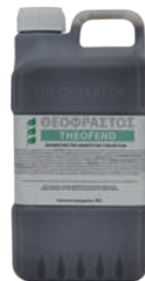
Supplied in 5L.

The liquid Organic THEOFEND is an organic liquid Growth Enhancer for plants. It is composed with plant organic extracts, which supplies the soil and the plants with organic matter instantaneously, via a slow release procedure. The organic-complex composition of THEOFEND provides an excellent absorption of macro/micro nutrients, which are essential for plants. It strengthens the root system and ion-exchange in the rhizosphere of plants. Application with THEOFEND induces a very rich root system, increased absorption and transfer of nutrient-ions systemically and homogenously from rhizosphere to the upper parts of the plant. Application via irrigation systems at 1.5-2L /0.1ha.