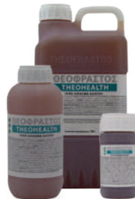
Supplied in 0.2L, 0.5L, 1L, 3L and 5L.

• Foliar application is recommended in the morning at 500-1000cc/100L water/0.1ha.