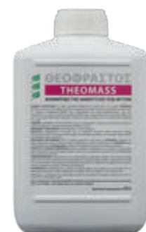
Supplied in 2L.

The organic liquid fertilizer THEOMASS is an exceptional supplement for plants by enhancing and strengthening Plant Growth. THEOMASS supplies the plants and the soil with organic matter instantaneously, via a slow release procedure. It has been shown that the organic complex of THEOMASS increases the absorption of nutrient macro-microelements from soil, which are necessary for the plants. Increases the root surface and activates the cells of root hairs for the absorbance of nutrients. THEOMASS strengthens the root system of plants and the ability of ion-exchange. Application in soil induces the development of a new root system, high absorbance of macro-microelements and rapid translocation of nutrients upward to the sides of plants without apical shoot meristem elongation. It has been constantly observed during the stage of maximum yield, THEOMASS helps the plants to overcome the stress caused by the high force for maximum production. At the same time, THEOMASS speeds up the next activities of the plant, like the development of new inflorescences, fruit setting and growth, for the next stage of crop production. Application via irrigation systems at 1 L/0.1 ha.